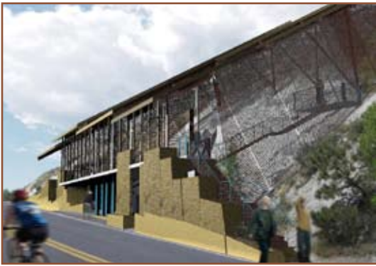
Artists concept of the proposed Track Site Cover

Before we can implement the following new projects on the Ridge over the next few years, we needed to submit a “site plan” to Jefferson County for their approval. We are hoping to get their approval of this site plan in the next couple of months.