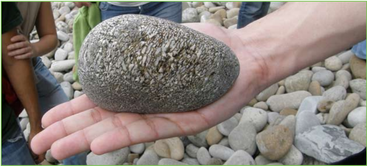
Well-rounded beach cobble made from eroded dinosaur bone