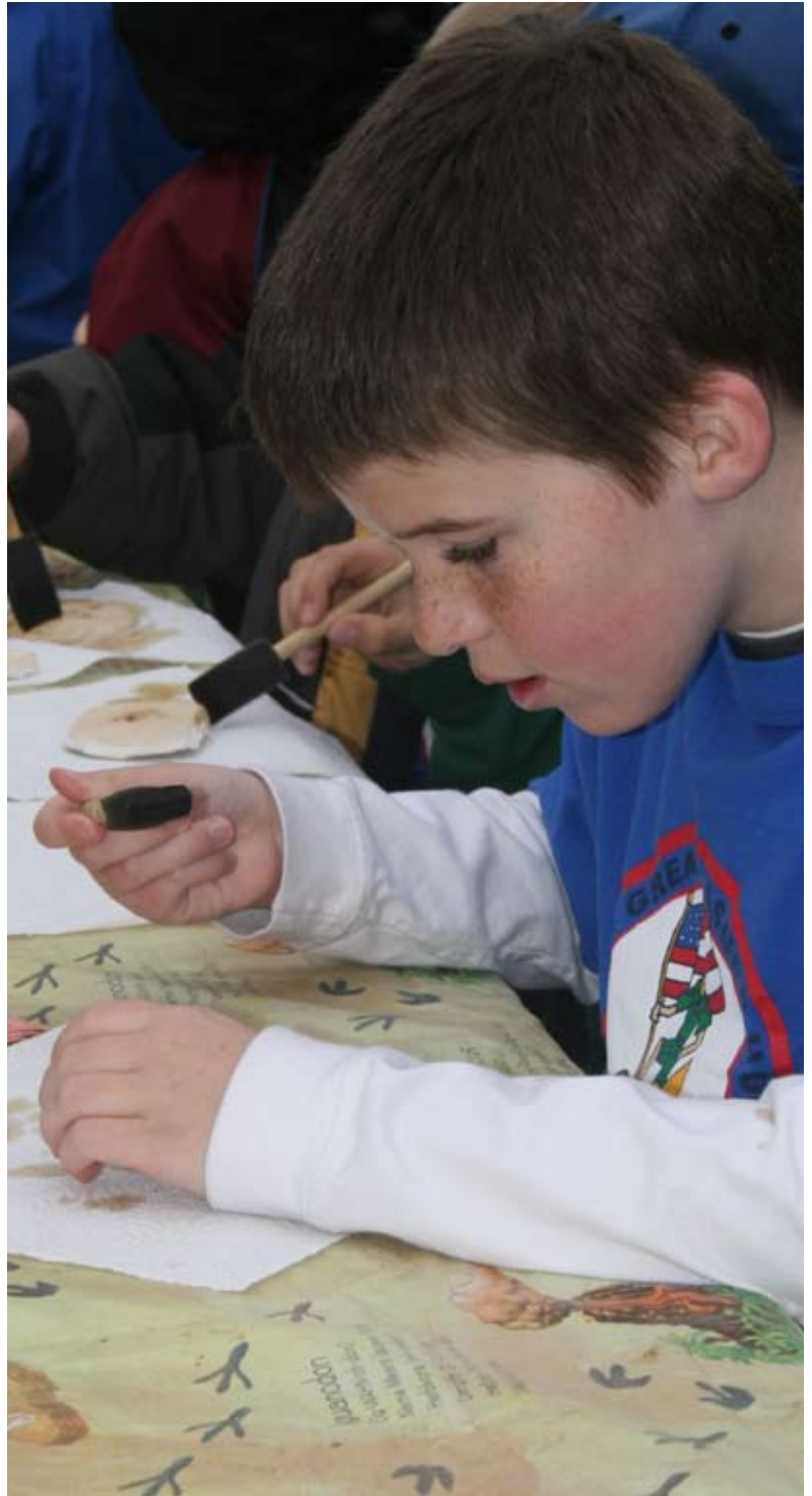
Activities at Boy Scout Day, May 2009 — Details in next issue.