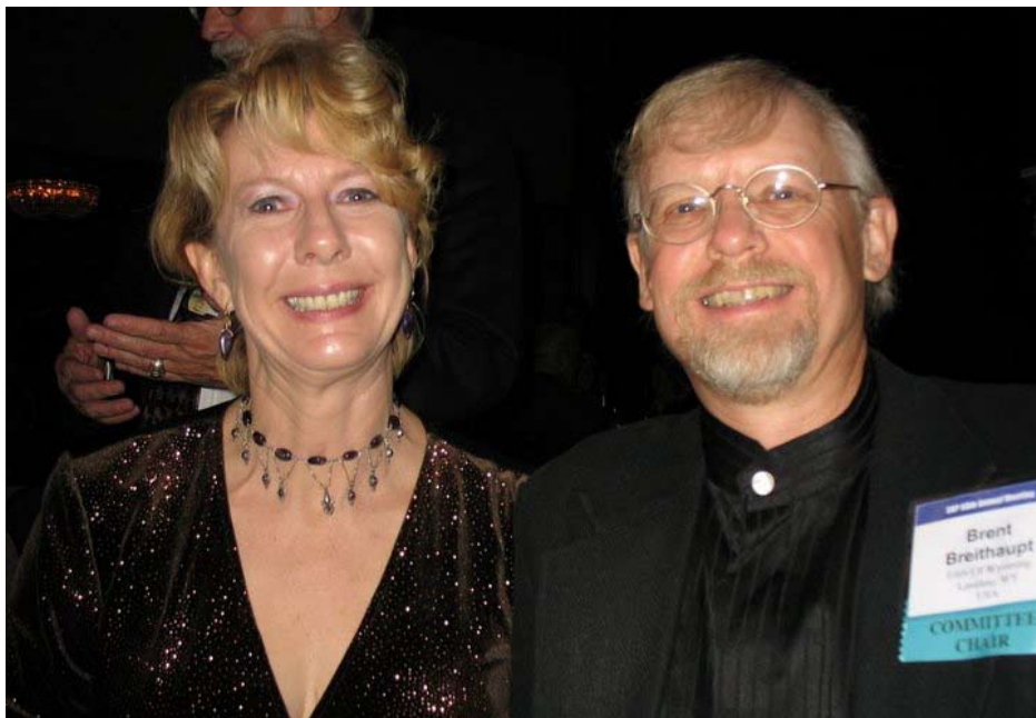
Brent and Neffra (SVP 2008)

In particular, important Middle Jurassic tracksites in Wyoming and Utah can now be easily compared with similar data from other localities. Digital track data for the United Kingdom (also known for significant Middle Jurassic dinosaur track localities) can be compared to those from North America. This comparison will provide a unique glimpse of the paleoecology, paleobiology, and behavioral complexities of Middle Jurassic theropod dinosaur communities in the Northern Hemisphere.