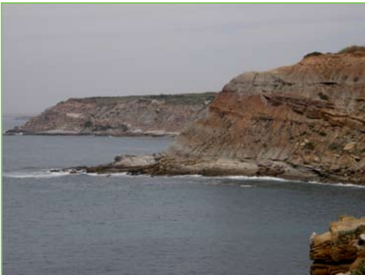
Morrison equivalent beds along the Atlantic in Portugal.