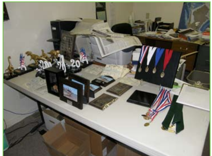
Phew! That's a lot of awards to give out!