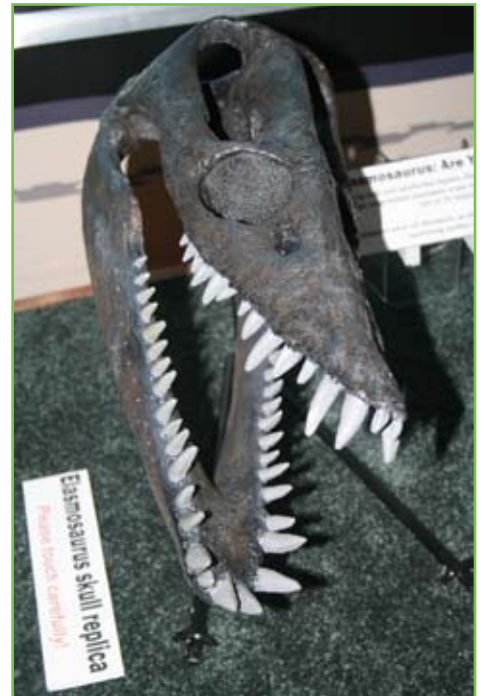
Elasmosaurus skull replica